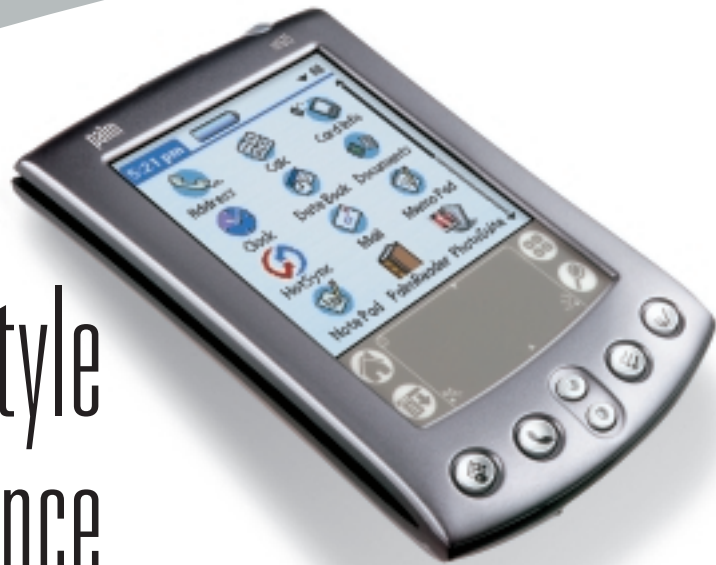
Palm™ m515 handheld